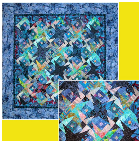
Dancing Log Cabin