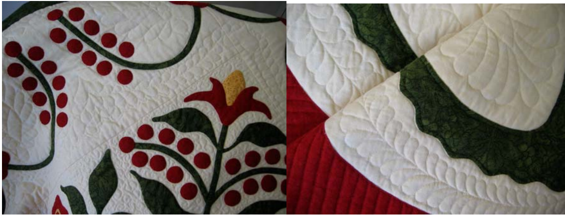
Examples of home machine quilting on Charlotte's "A Thousand and One Berries?"