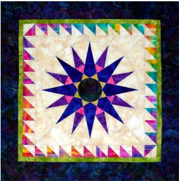
Basic Mariner's Compass