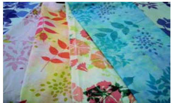
Samples of Jane's dyed and printed fabrics