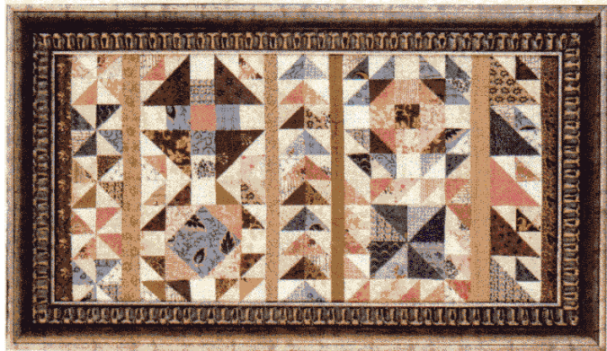
Lori Smith: Fit to Frame (fits standard 10x20 frame)